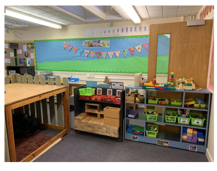
Year 1 Continuous Provision